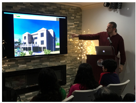
Interested in hosting?

Whether it's a casual tea or dinner party, we're ready to brainstorm with you to create a fun home fundraiser experience!